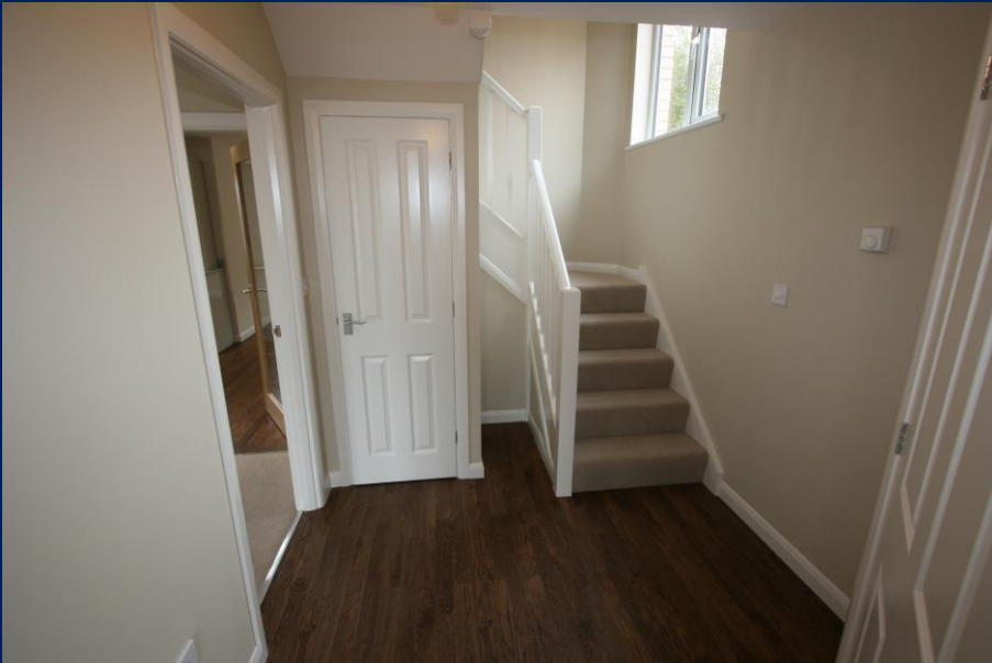
Front Door and Down stairs W.C